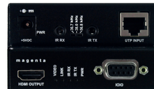
HD-ONE LX500 TRANSMITTER (L) AND RECEIVER (R) FRONT/BACK VIEW