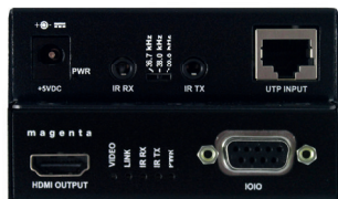
HD-ONE LX TRANSMITTER (L) AND RECEIVER (R) FRONT/BACK VIEW