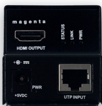
HD-ONE DX TRANSMITTER (L) AND RECEIVER (R) FRONT/BACK VIEW