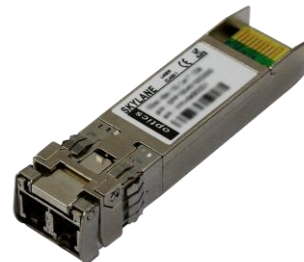
Figure 1. SFP+ Dual Fibre (non-binding illustration)