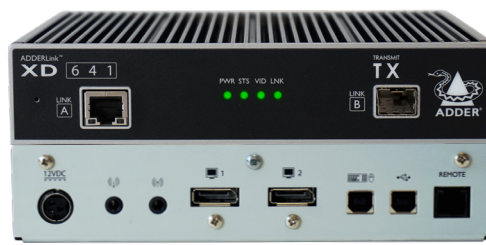
ADDERLink XD641 TX - Front & Rear