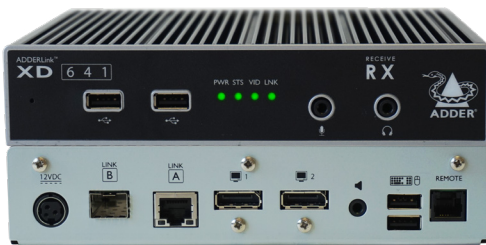
ADDERLink XD641 RX - Front & Rear

CAT6 is recommended for CATx extensions. CATx extensions are limited to 2 patch connections. Patch cables should be CAT6 or better.