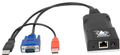
ADDERLink INFINITY 100T - VGA