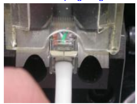
Remark: According to FCC standard, H=6.02±0.13M