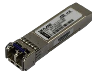
Figure 1. SFP Dual Fiber 1310nm (non-binding illustration)