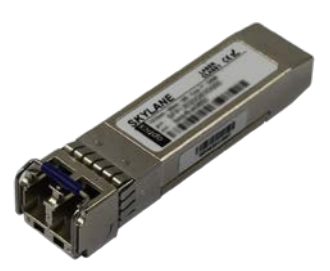
Figure 1. SFP Dual Fiber 1310nm (non-binding illustration)

4. The optical input to the receiver should not exceed this value. Transmitters must never be directly connected to receivers (optical loop back) before ensuring that proper optical attenuation is used.