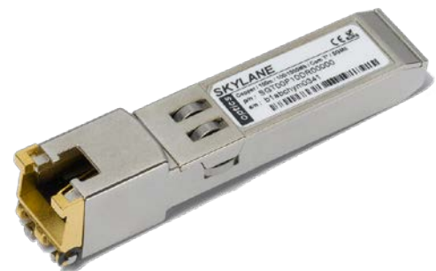
Figure 1. SFP Copper (non-binding illustration)