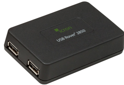
REX (Remote Extender)