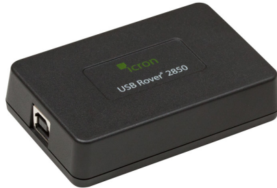
LEX (Local Extender)