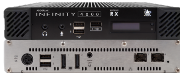
ALIF4001 RX - Front & Rear