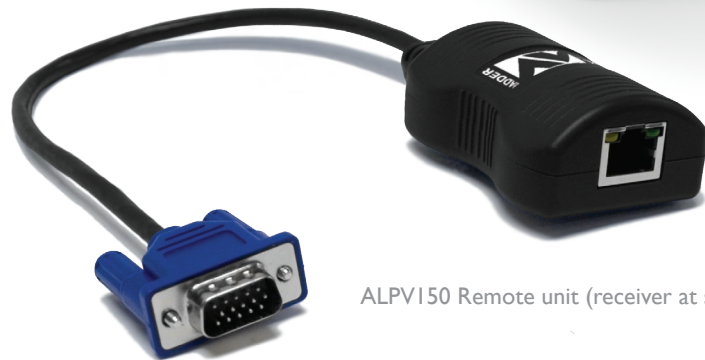
ALPV150 Remote unit (receiver at screen)

© Copyright 2011 Adder Technology Ltd. All brand names and trademarks are the property of their respective owners. LM-ALPV154v4.J5.indd