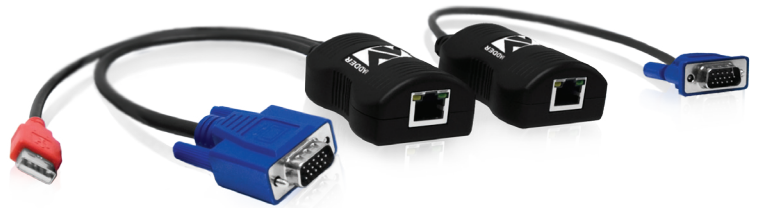
ALPVI50 Pair (single screen)

High density, small form factor line powered video distribution