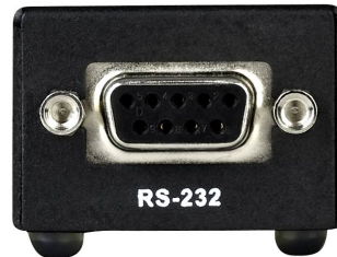
1. RS232 (DB-9 Female Connector)