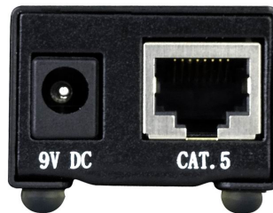
1. Power jack 2. CAT.5 (RJ-45 Connector)